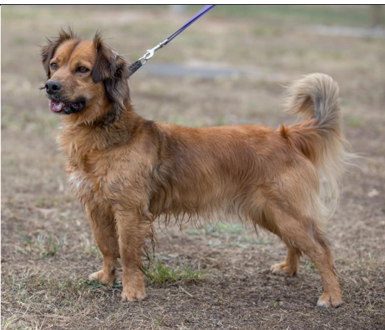
Jimmy (4yr old male Spaniel x)

We also have some amazing helper dogs (non-greyhounds) who would love to spend Christmas in a home this year! They are: