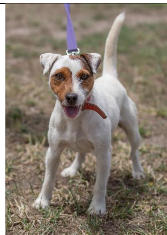
Stix (1yr old male JRT)